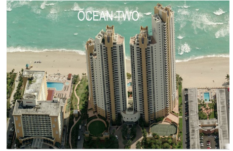
Built in 2001 - 253 units - 40 floors

Ocean Two Condominium Association 305-466-4133 extension 12 & Manager@OceanTwo.com http://oceantwo.com/sub_category_list.asp?category=4&title=Contact+Us