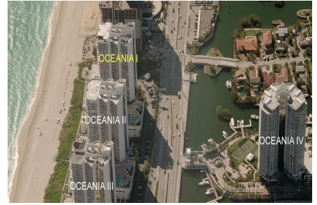
Built in 1990 - 164 units - 28 floors

Oceania I Condo Association (305) 354-2170