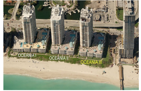
Built in 1994 - 156 units - 28 floors

Oceania III Condo Association (305) 919-8668