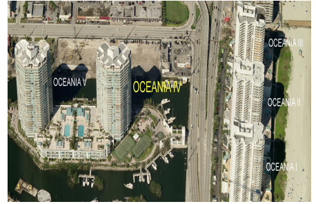
Built in 2002 - 158 units - 29 floors

Oceania Tower 4 Condo Assn dwelling operator: (305) 947-1068