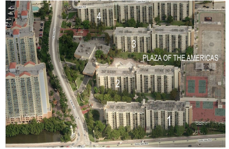
Built in 1979 - 190 units - 10 floors