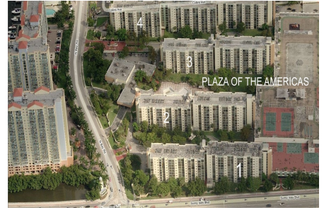
Built in 1979 - 190 units - 10 floors