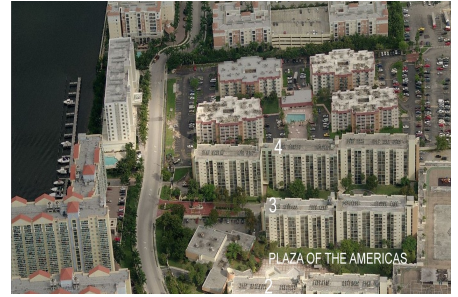
Built in 1979 - 171 units - 10 floors