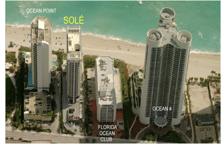
Built in 2007 - 147 units - 23 floors

Sole on the Ocean Condominium (786) 923 9300