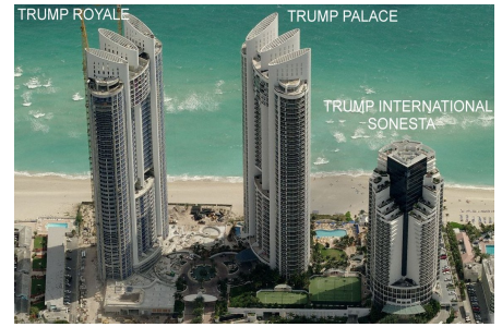
Built in 2003 - 372 units - 30 floors