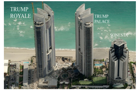
Built in 2008 - 384 units - 55 floors