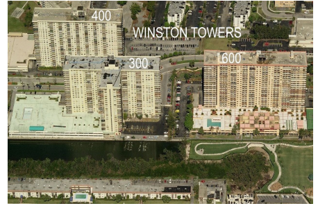
Built in 1973 - 416 units - 23 floors

Winston Tower 300 Condominium Association (305) 932-5290