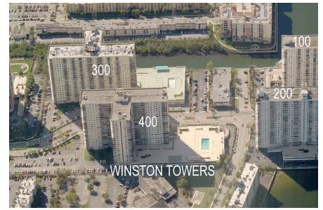
Built in 1974 - 420 units - 23 floors

Winston Tower 400 Condominium Association (305) 932-2550