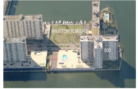
Built in 1976 - 420 units - 23 floors

Winston Tower 500 Condominium Association (305) 931-2628