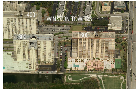
Built in 1981 - 391 units - 23 floors

Winston Tower 600 Condominium Association (305) 932-4755