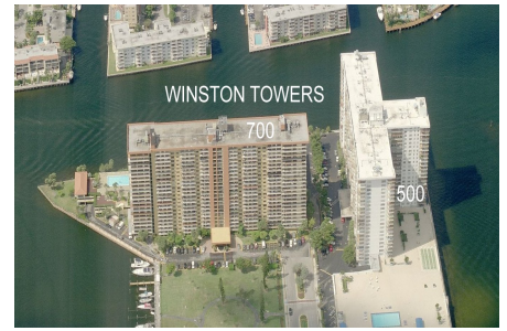
Built in 1980 - 391 units - 23 floors

Winston Tower 700 Condominium Association (305) 931-5998 & (305) 935-0670