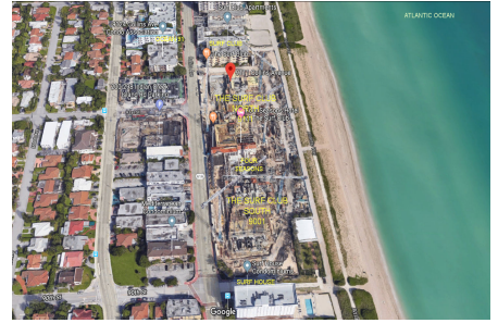
Built in 2017 - 151 units - 12 floors

The Surf Club Address: 9011 Collins Ave, Surfside, FL 33154, Phone: +1 305-330-4000 http://thesurfclub.com/home.php