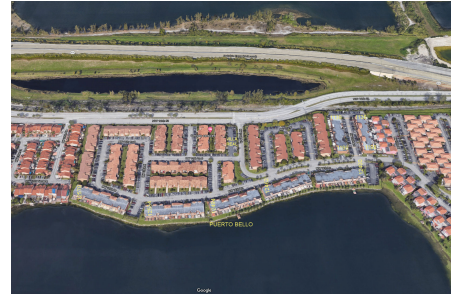
Built in 1997 - 116 units - 2 floors