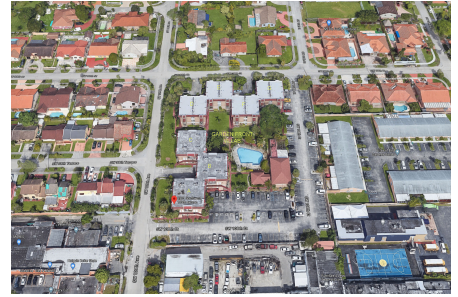
Built in 1971 - 84 units - 3 floors

Garden Front Villas Address: 3901 SW 109th Ave, Miami, FL 33165