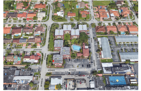
Built in 1971 - 84 units - 3 floors

Garden Front Villas Address: 3901 SW 109th Ave, Miami, FL 33165