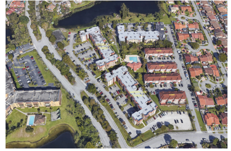
Built in 1983 - 124 units - 4 floors

Number of units: 124 Number of active listings for rent: 0 Number of active listings for sale: 1 Building inventory for sale: 0% Number of sales over the last 12 months: 2 Number of sales over the last 6 months: 1 Number of sales over the last 3 months: 1