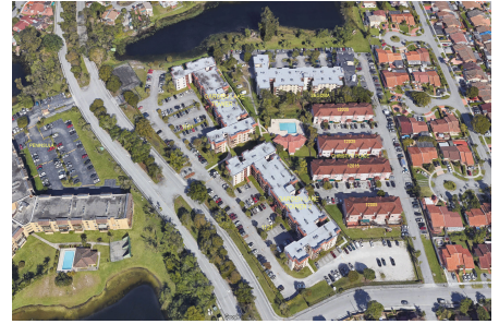
Built in 1983 - 124 units - 4 floors