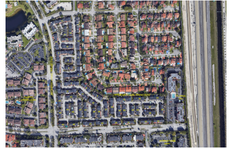
Built in 1984/1988 - 390 units - 2 floors

International Princess Condominiums Address: 1555 SW 122nd Ave, Miami, FL 33184