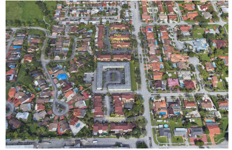
Built in 1981 - 73 units - 2 floors

Number of units: 73 Number of active listings for rent: 0 Number of active listings for sale: 0 Building inventory for sale: Number of sales over the last 12 months: 0% Number of sales over the last 6 months: 0 Number of sales over the last 3 months: 0