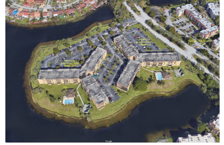
Built in 1984 - 196 units - 4 floors

Peninsula Association Inc? 1350 SW 122nd Ave, Miami, FL 33184 (305) 551-3500