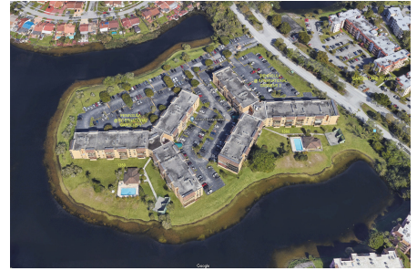
Built in 1984 - 196 units - 4 floors

Peninsula Association Inc? 1350 SW 122nd Ave, Miami, FL 33184 (305) 551-3500