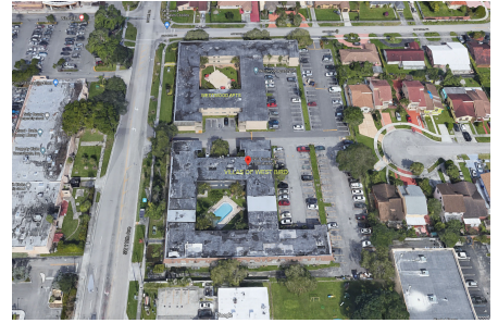
Built in 1969 - 52 units - 2 floors