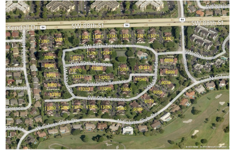
Built in 1986 - 274 units - 2 floors

CALUSA POINT ASSOCIATION INC 13310 SW 88TH TER MIAMI, FL 33186-1709 (305) 386-7374 http://calusapointhoa.com/