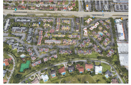
Built in 1986/1990 - 338 units - 2 floors