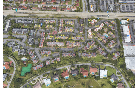
Built in 1986/1990 - 338 units - 2 floors