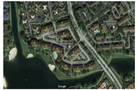
Built in 1987 - 316 units - 3 floors

Hammocks Trail Condo Association Address: 15301 SW 106th Ln, Miami, FL 33196, Phone: +1 305-383-3301 http://www.thecrossingshoa.net/home.asp