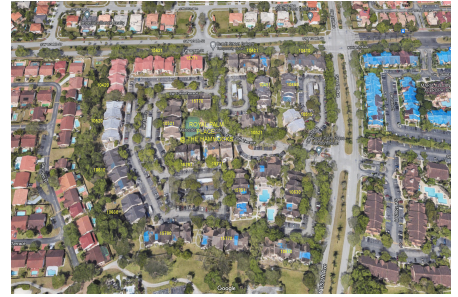
Built in 1990 - 375 units - 3 floors

Royal Palm Place Condominium Address: SW 157th Ave, Miami, FL 33196 (305) 386-7707