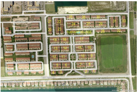
Built in 2005 - 324 units - 2 floors

Tuscany Village HOA Inc 12801 SW 133 St Miami, FL 33186 Phone: (305) 251-1149