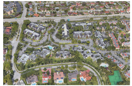
Built in 1983/1986 - 276 units - 4 floors

Calusa Club Village Property Owners 14275 SW 142nd Ave Miami, FL 33186 (305) 253-7977