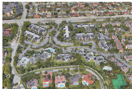
Built in 1983/1986 - 276 units - 4 floors

Calusa Club Village Property Owners 14275 SW 142nd Ave Miami, FL 33186 (305) 253-7977