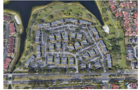
Built in 1982 - 264 units - 2 floors

Hammocks Community Association Address: 9020 Hammocks Blvd, Miami, FL 33196 Phone: +1 305-382-3999 https://www.hammockscommunityassociation.com/