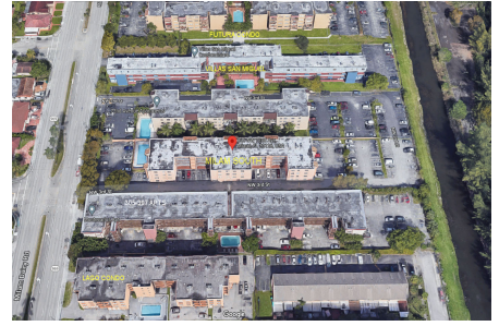
Built in 1982 - 44 units - 4 floors

Milam Condominium Address: 325 NW 12th St, Miami, FL 33126