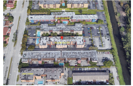
Built in 1982 - 44 units - 4 floors

Milam Condominium Address: 325 NW 12th St, Miami, FL 33126