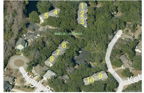
Built in 1983 - 60 units - 3 floors

AMELIA LANDINGS PROPERTY OWNERS ASSOCIATION, INC. 5440 1ST COAST HWY AMELIA ISLAND FL 32034 PHONE 904-277-5122 FAX 904-491-4246 EMAIL info@aimamelia.com