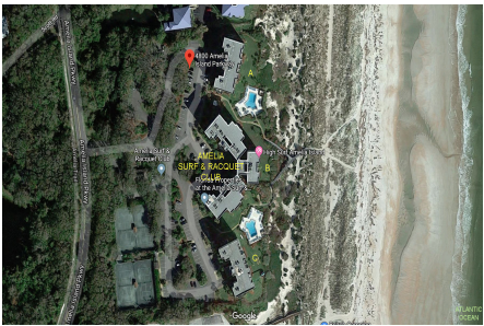
Built in 1982 - 156 units - 7 floors

Amelia Surf & Racquet Club Address: 4800 Amelia Island Pkwy, Fernandina Beach, FL 32034 Phone: +1 866-206-1259 https://ameliasurfandracquetclub.com/