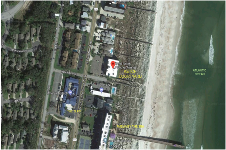
Built in 1984 - 32 units - 4 floors

Ketch Courtyard Address: 3150 S Fletcher Ave, Fernandina Beach, FL 32034 Phone: +1 904-261-0677