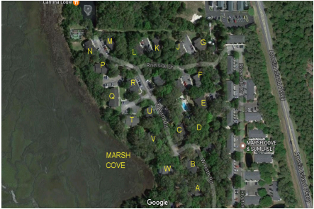
Built in 1974 - 120 units - 2 floors

MARSH COVE & SOMERSET Address: 123 W Hirth Rd, Fernandina Beach, FL 32034, Phone: +1 904-261-0791