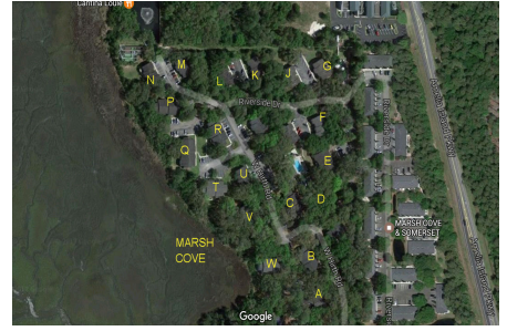
Built in 1974 - 120 units - 2 floors

MARSH COVE & SOMERSET Address: 123 W Hirth Rd, Fernandina Beach, FL 32034, Phone: +1 904-261-0791