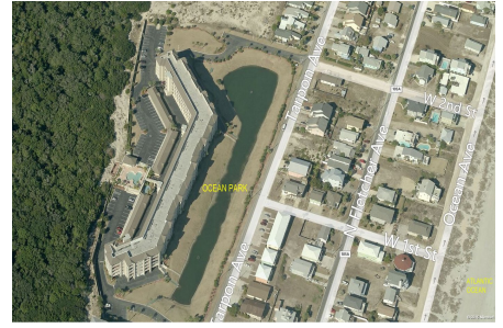
Built in 2001 - 95 units - 4 floors

OCEAN PARK CONDOMINIUM OWNERS' ASSOCIATION, INC. MAY MANAGEMENT SERVICES INC 1637 RACE TRACK RD # 206 ST JOHNS FL 32259 PHONE 904-561-9708 FAX 904-461-0335