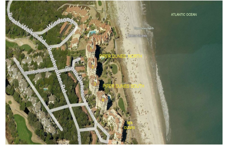
Built in 1994 - 26 units - 7 floors

Piper Dunes Association Address: 1530 Beach Walker Rd, Fernandina Beach, FL 32034, Phone: +1 904-277-8628 Piper Dunes Association 1530 Shipwatch Cir, Fernandina Beach, FL 32034 (904) 277-8628 Piper Dunes Association 1530 Beach Walker Road Fernandina Beach, FL 32034 Phone: (904) 277-8628 Piper Dunes Condominium Association 1546 Beech St Fernandina Beach, FL 32034 Phone: (904) 277-8402