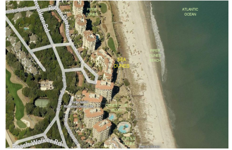
Built in 1984 - 58 units - 6 floors

Number of units: 58 Number of active listings for rent: 0 Number of active listings for sale: 0 Building inventory for sale: Number of sales over the last 12 months: 0% Number of sales over the last 6 months: 0 Number of sales over the last 3 months: 0