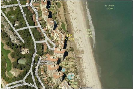
Built in 1984 - 58 units - 6 floors

SEA DUNES CONDOMINIUM ASSOCIATION, INC COURSON & STAM LLC, 2398 Sadler Rd, Fernandina Beach, FL 32034 Phone: +1 904-261-7803