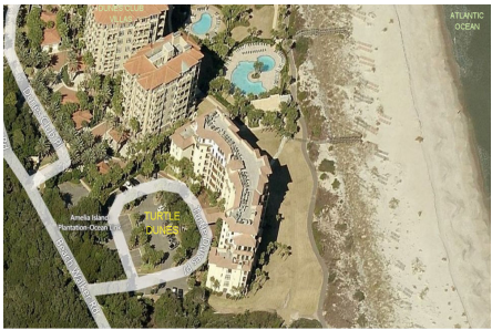
Built in 1985 - 58 units - 6 floors

Piper Dunes Association Address: 1530 Beach Walker Rd, Fernandina Beach, FL 32034, Phone:+1 904-277-8628