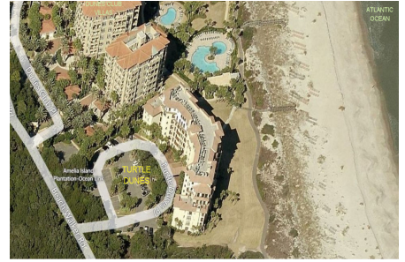
Built in 1985 - 58 units - 6 floors

Number of units: 58 Number of active listings for rent: 0 Number of active listings for sale: 0 Building inventory for sale: Number of sales over the last 12 months: 0% Number of sales over the last 6 months: 1 Number of sales over the last 3 months: 0