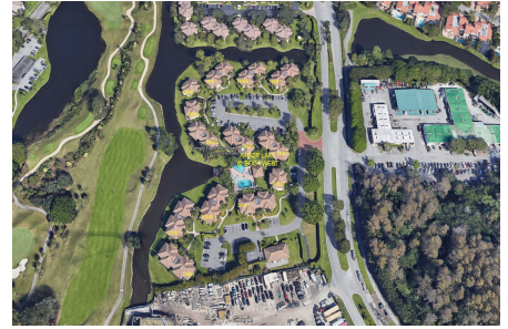
Built in 1980 - 46 units - 2 floors

Boca West Homeowners Associates Inc Address: 19273 Sabal Lake Dr, Boca Raton, FL 33434 Phone: +1 561-488-1598