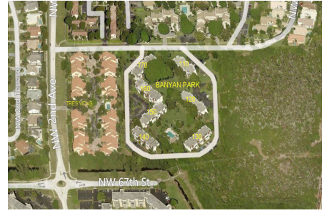
Built in 1982 - 68 units - 2 floors

Banyan Park Condominium Association 100 Nw 70th St Boca Raton, FL 33487-2312 (561) 989-9108