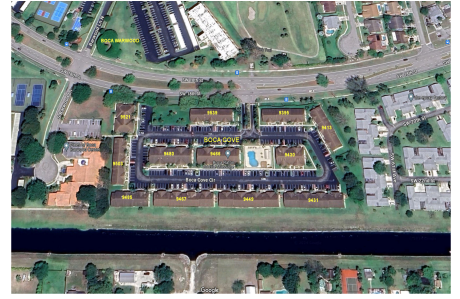
Built in 1986/1990 - 192 units - 2 floors

Boca Cove Condo Association Address: 9448 Boca Cove Cir, Boca Raton, FL 33428 Phone: +1 561-218-3323 https://www.bocacoveassociation.com/home/