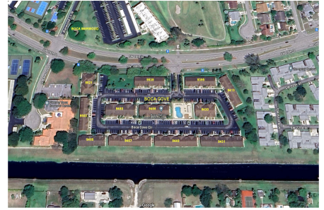
Built in 1986/1990 - 192 units - 2 floors

Boca Cove Condo Association Address: 9448 Boca Cove Cir, Boca Raton, FL 33428 Phone: +1 561-218-3323 https://www.bocacoveassociation.com/home/