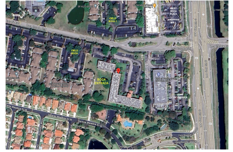
Built in 1983 - 68 units - 4 floors

Boca Entrada 10235 Boca Entrada Blvd Boca Raton, FL 33428 (561) 488-4983