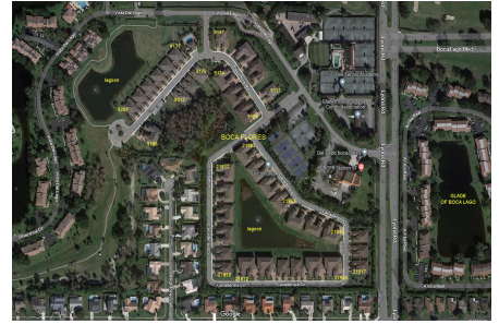
Built in 2020 - 120 units - 2 floors

Number of units: 120 Number of active listings for rent: 0 Number of active listings for sale: 2 Building inventory for sale: 1% Number of sales over the last 12 months: 4 Number of sales over the last 6 months: 0 Number of sales over the last 3 months: 0