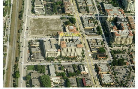
Built in 2004 - 164 units - 9 floors

Boca Grand Condominium Association, Inc 233 S Federal Highway # 101 Boca Raton, FL33432 (561) 338-2172