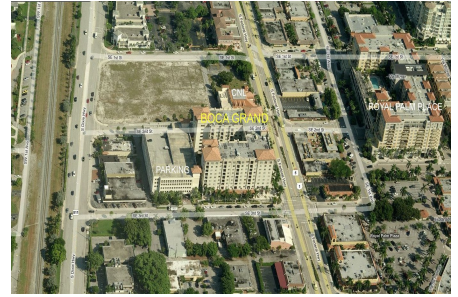
Built in 2004 - 164 units - 9 floors

Boca Grand Condominium Association, Inc 233 S Federal Highway # 101 Boca Raton, FL33432 (561) 338-2172