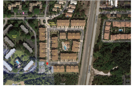
Built in 2017 - 76 units - 2 floors

Boca Highland Beach Club and Marina Address: 4801 S Ocean Blvd, Highland Beach, FL 33487 Phone: +1 561-391-2461 http://www.bocahighland.com/