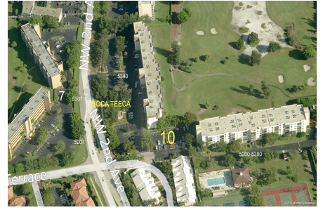
Built in 1984 - 143 units - 5 floors

Boca Teeca Condominium No 10 Inc 5240 Nw 2nd Ave Boca Raton, Florida 33487-4811 (561) 241-1732