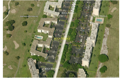
Built in 1969 - 84 units - 3 floors

BOCA TEECA CONDOMINIUM NO. 2, INC. OXYGEN ASSOCIATION SERVICES INC 2801 N UNIVERSITY DR STE 204 CORAL SPRINGS FL 33065 WWW.OXYGENASSOCIATIONSERVICES.COM