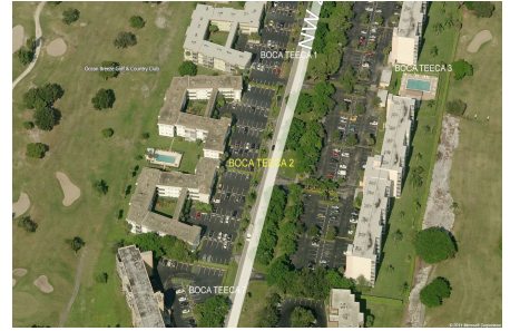
Built in 1969 - 84 units - 3 floors

BOCA TEECA CONDOMINIUM NO. 2, INC. OXYGEN ASSOCIATION SERVICES INC 2801 N UNIVERSITY DR STE 204 CORAL SPRINGS FL 33065 WWW.OXYGENASSOCIATIONSERVICES.COM