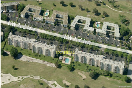
Built in 1970 - 168 units - 7 floors

Boca Teeca Condominiums No 3 Inc 5500 NW 2nd Avenue Boca Raton, FL 33487-3898 (561) 994-0801