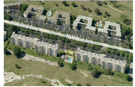
Built in 1970 - 168 units - 7 floors

Boca Teeca Condominiums No 3 Inc 5500 NW 2nd Avenue Boca Raton, FL 33487-3898 (561) 994-0801