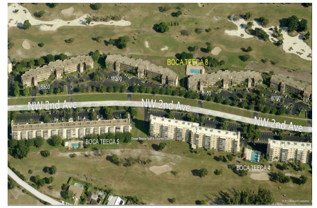
Built in 1978 - 155 units - 4 floors

Boca Teeca Condominium Association #8 6000 NW 2 Ave Boca Raton Blvd Bocaraton, Boca Raton, FL 33431 (561) 989-0918