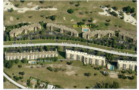
Built in 1978 - 155 units - 4 floors

Boca Teeca Condominium Association #8 6000 NW 2 Ave Boca Raton Blvd Bocaraton, Boca Raton, FL 33431 (561) 989-0918